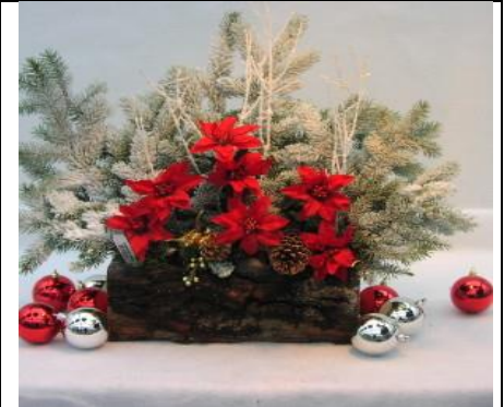
Planter Flocked with Artificial Snow