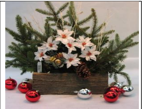
Log Planter with Greens Only